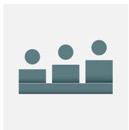
2019 Emerging Leaders Series - Dallas