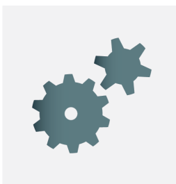
2019 NMHC OPTECH Conference & Exposition