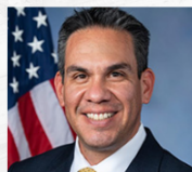
CONGRESSMAN PETE AGUILAR (D-CA) VICE CHAIR, HOUSE DEMOCRATIC CAUCUS