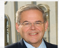
SENATOR BOB MENENDEZ (D-NJ) SENATE FINANCE AND BANKING, HOUSING, AND URBAN AFFAIRS COMMITTEES