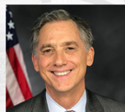
CONGRESSMAN FRENCH HILL (R-AR) HOUSE FINANCIAL SERVICES COMMITTEE