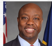
SENATOR TIM SCOTT (R-SC) SENATE FINANCE AND BANKING COMMITTEES