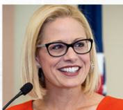
SENATOR KYRSTEN SINEMA (D-AZ) SENATE BANKING, HOUSING AND URBAN AFFAIRS COMMITTEE