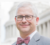
CONGRESSMAN PATRICK MCHENRY (R-NC) HOUSE FINANCIAL SERVICES COMMITTEE