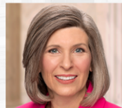
SENATOR JONI ERNST (R-IA) VICE CHAIR, SENATE REPUBLICAN CONFERENCE