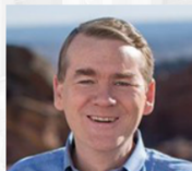
SENATOR MICHAEL BENNET (D-CO) SENATE FINANCE COMMITTEE