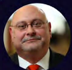
Greg Willett RealPage